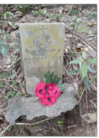
Exploring Taiwan's only concrete POW gravestones.