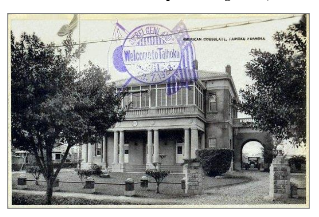
The American Consulate in Taihoku 1928 - Japanese era postcard