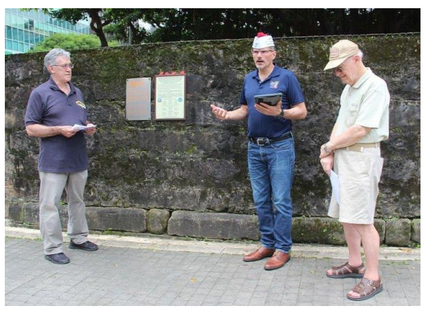
Memorial Day Service - May 30th.