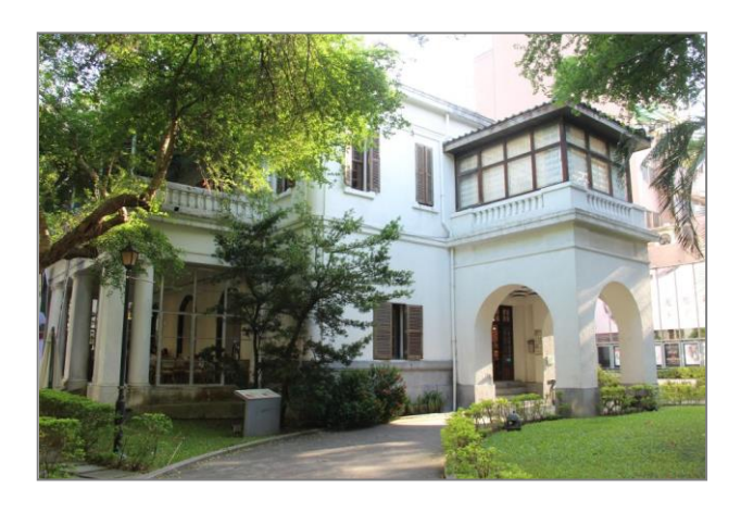
The former American Consulate – now the SPOT Theatre - location for FEPOW Day.