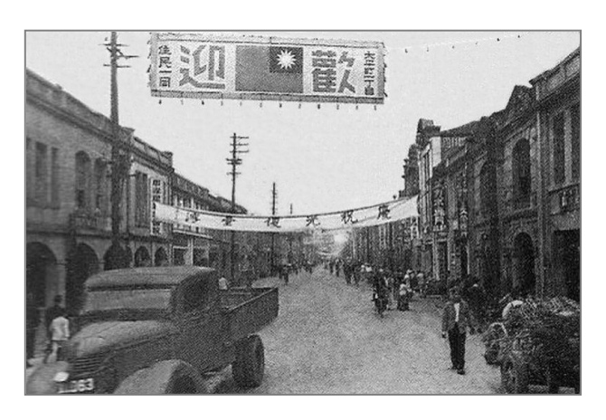
"Victory - The War Is Over" – Celebration banners in downtown Taipei on August 15, 1945.

We hope to welcome many members and friends – and some new faces too. See you in August!