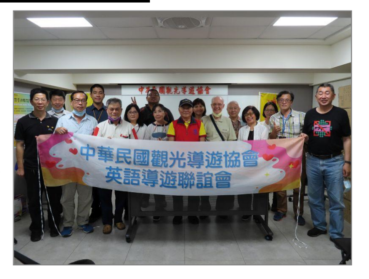
The group after the class.

The first informal class was held on February 24th with about 30 people present. Then again on April 13th the first official class was held at the Tour Guides Association headquarters where about 20 were in attendance. In both classes the guides listened intently and afterward told me