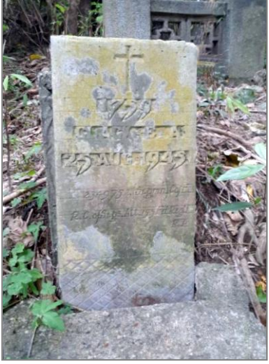
The mystery grave stone at Shokoshihi Cemetery.

So on Thursday April 7th, accompanied and guided by my new friend, we visited the cemetery. On looking at the stones, from the outset I knew this to be a very strange thing to have Taiwan POWs' graves marked with a