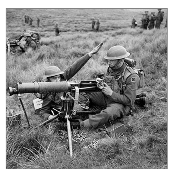
9th Btn. Royal Northumberland Fusiliers training in England. Note the British 18th Division shoulder patch on the gunner.

Approaching Singapore on the 5th of February 1942, the ship was attacked by Japanese aircraft, but they were effectively fought off and the ship docked at Keppel Harbour later that day. From February 6th to the 15th the battalion helped to try to stem the Japanese onslaught, but it was too little too late and Singapore was surrendered later that day and they all became prisoners of war.