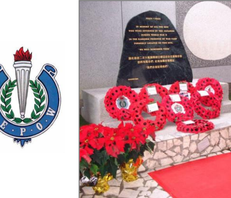
10th Anniversary of the dedication of the Karenko POW Camp Memorial.