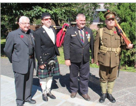
2018 Remembrance Day Service marking one hundred years since the end of WW1. (See story on page 8)