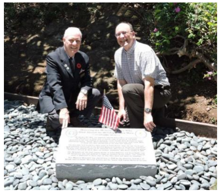
(Cont'd on page 6)